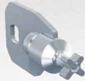
Unique keyway; cannot be duplicated. Sold separately.